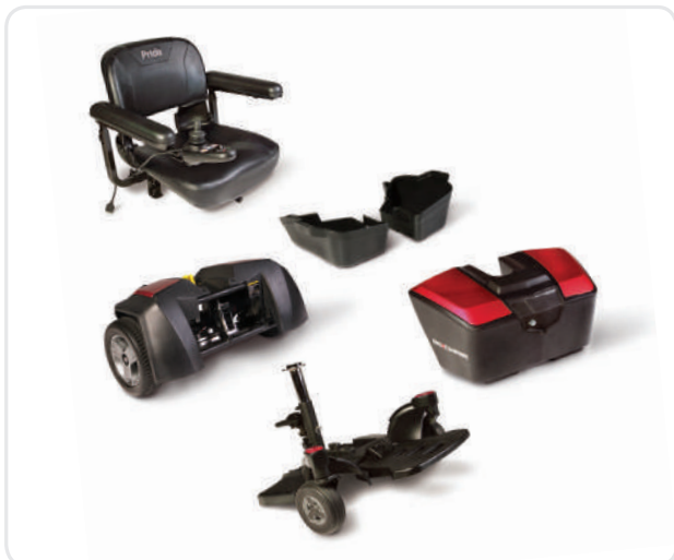
One-hand "Feather Touch" disassembly

The all-new Go Chair® is re-engineered from the ground up, offering a bold style available in an array of contemporary colours. Enhanced performance and comfort, along with feather-touch disassembly, allows you to enjoy lightweight travel and independence on the go. With an increased weight capacity of 136 kgs (300 lbs.) and a sleek, bold look, the Go Chair® makes travel easy.