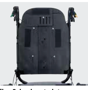
Flex 3, backrest plate Apart from being height adjustable it is now width adjustable as well.

The backrest has a biomechanical positioning hinge, which follows the user's natural back movement when adjusting the backrest angle. Combined with the seat-tilt function, the DSS (Dual Stability System) helps to prevent Decubitus thanks to its nonfriction re-body positioning.