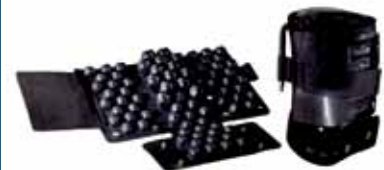
ROHO® HEAL PAD® Cushion