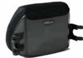
JetStream Pro® Back Support System