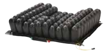
ROHO® CONTOUR SELECT® CUSHION