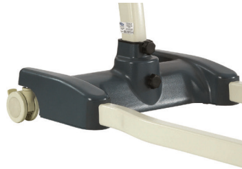
Electric leg adjustment. Easy and effortless solution for positioning lifter when transferring a user.