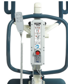
Intelligent monitoring system.