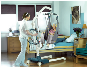
Full lift range and good clearance for the user.