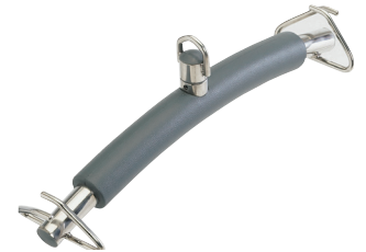
2 point spreader bar as standard.