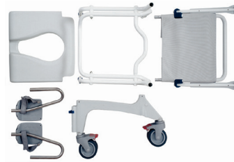
Easy disassembly for mobile use, e.g. on travels.