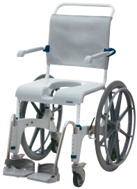
Ocean 24" wheels Self-propel model with 24" wheels, quick-release axles and four castors.